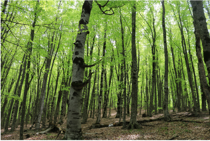
SFM practices are implemented in Akhmeta Forest in the project region of Kakheti and in Mtskheta-Mtianeti and Guria.